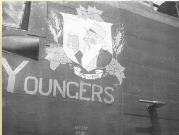
463 - Y JO - Y "Youngers"

The winter of 1944 was as hard as any other of the three years most of