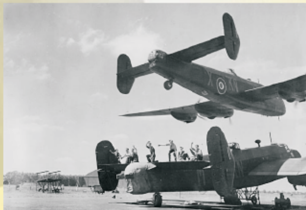
A low pass by a MkII Halifax at 77 Squadron RAF Elvington UK