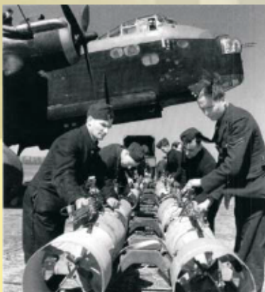
Tail fused bombs being prepared at a Stirling squadron

That shock wave hit the aircraft with such violence that it ripped