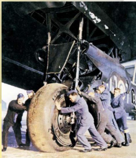
RAF fitters pushing a Lancaster into position for hangar maintenance