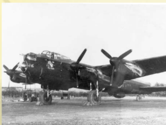
463-P JO-P "Piratical Pete"

It was a particularly bitter night in the winter of 1944 as the Warrant Officer made a last check of the dispersals of his Flight at 463 Squadron, Waddington. Snow swirled around him as he trudged from bay to bay, it was not a night to be out. Under the wing of a Lancaster something moved, instantly alert the W/O cautiously approached a man. To put the other off-guard he bellowed at him "Who the bloody hell are you?"