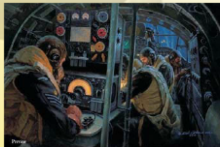
Radio operators position in a Lancaster

463 - P JO - P The Australian Armourer has a lambskin vest send by an Comforts Fund from Home