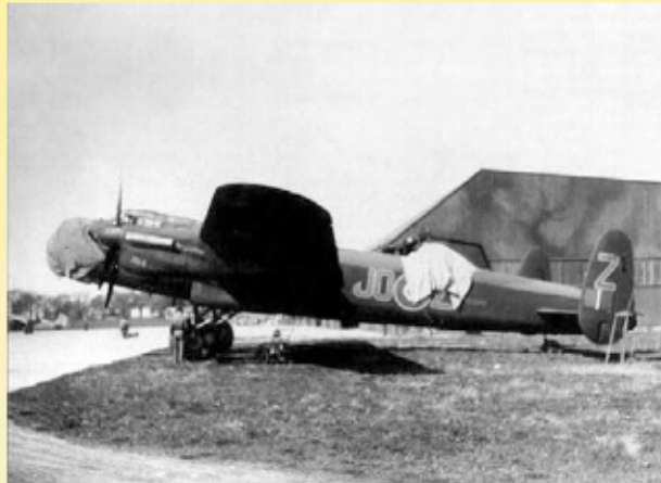
463 - Z JO - Z Landed safely in Sweden by Flying Officer A Cox after D Day (yellow outlines on lettering set the date as after 6/6/1944)