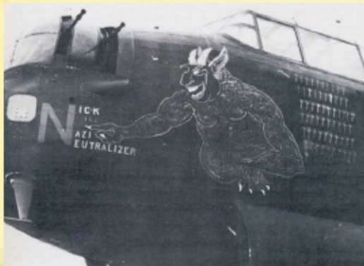
463 - N JO - N Nick the Nazi Neutralizer

For the crew it was a two-edged sword, relief that they would be spared a night of Flak and weather over Germany. On the other hand, it meant they would have to make up another trip to complete their