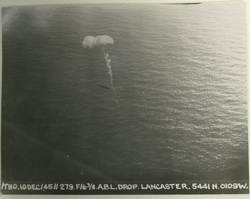
THO.10 DEC/45 // 279. F/6 3 / 8 .AB.L. DROP. LANCASTER. 544I N. 0109W.