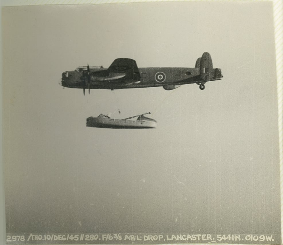
2978 /THO.10/DEC/45 // 280. F/6 3 / 8 AB.L. DROP. LANCASTER. 544IN. 0109W.